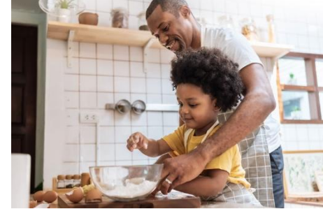
Have fun exploring maths