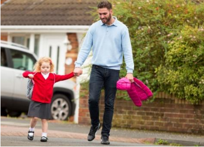
Communicate and talk with your child