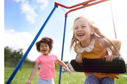
Encourage your child to talk and play with others