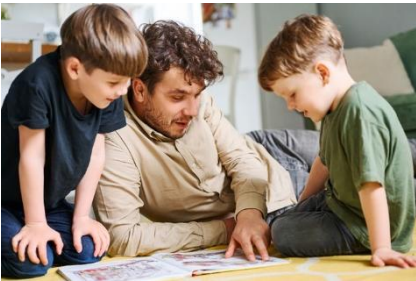
Read, tell and make up stories together