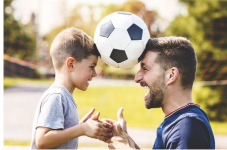
Enjoy physical activities together