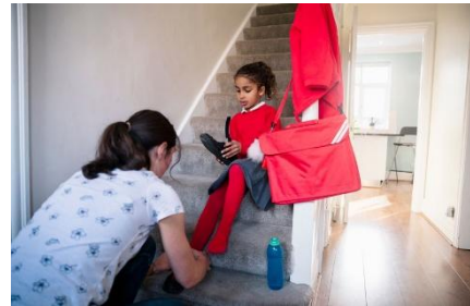
Support your child to do things by themselves